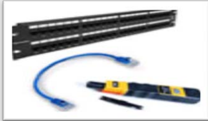
Copper Network Solution