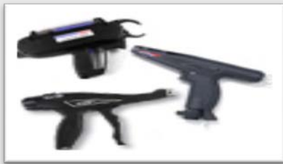
Cable Tie Tools