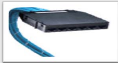
Rapidnet Pre-terminated Networking