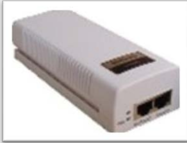
1port POE Injector