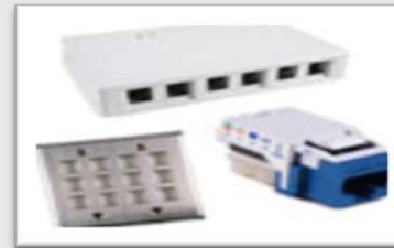
Jacks Faceplates and Boxes