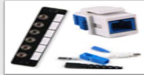
Fiber Network Solution